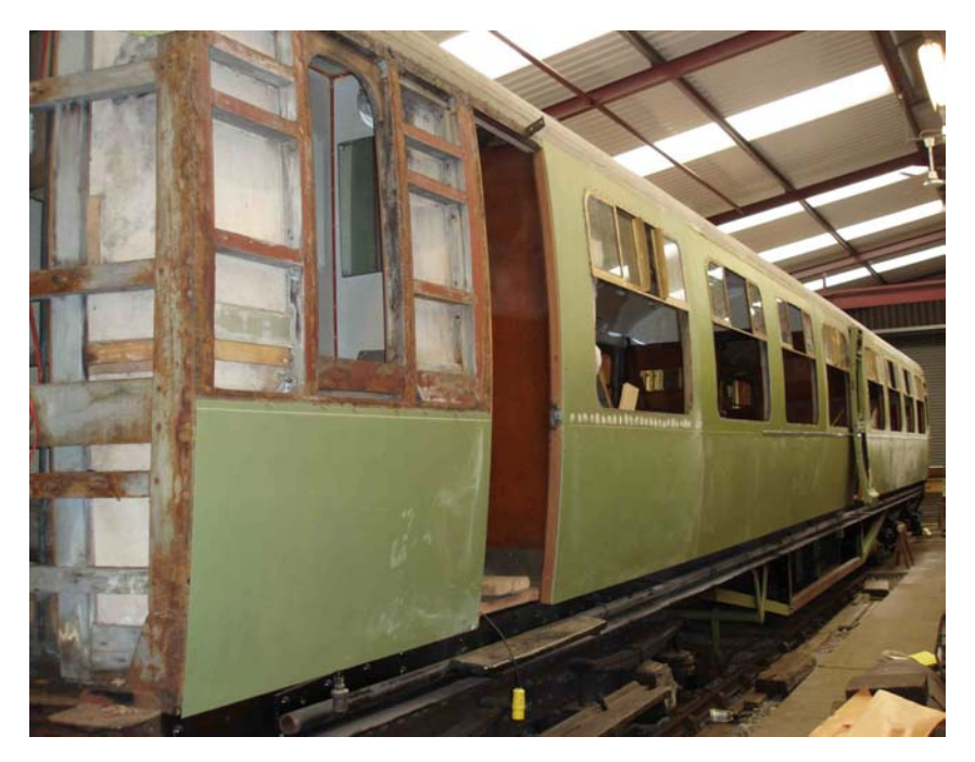
Our Bulleid coach as seen in late March this year. The "missing" upper section of the cladding can be seen top left, with the exposed wooden framing of the Keighley end extreme left. The toplights are glazed, and the waist strip can be seen on the further half of the coach.

Drilling holes and fixing window frames are but two of the many tasks still to do on this coach.