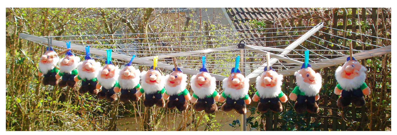
Volunteers and Workers: Here a happy band of VCT Helpers hang about waiting eagerly for their assignments – there is plenty of room on the line for more willing hands.

"Hunt the Helpers" is a favourite game for our very youngest visitors with the possibility of a small prize in the monthly draw. The postcodes of their addresses provide us with a valuable visitor survey tool. These particular "Helpers" have just enjoyed a good wash as part of the Museum's spring cleaning programme!