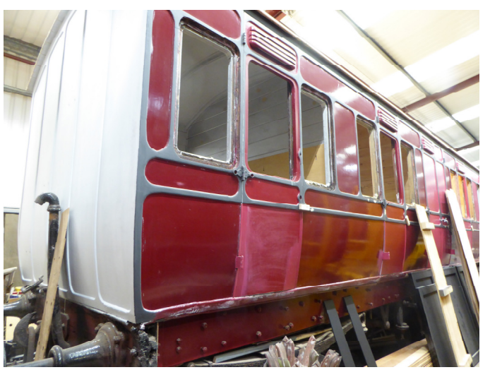
Right: as seen, April 2016.