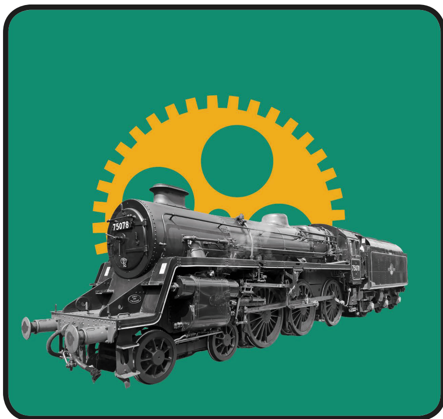
Photo: Keighley Transport Festival now hoping to take place in May 2021

Unfortunately due to Covid-19 most of the Rail Story and KWVR events for 2020 have been cancelled or postponed. These include the Keighley Transport Festival, the Diesel Gala, the Railway Children Anniversary event, the Yorkshire Food and Drink festival and the Beer & Music festival. This has and continues to significantly affect our footfall but we hope that these events can return next year for everyone to enjoy when it's safer!