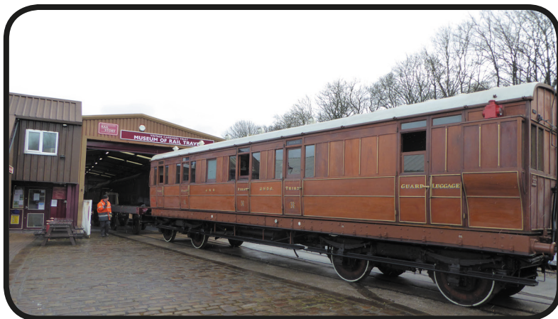
GNR No 2856 on a rare outing from the museum.

No S1469S Bulleid Open Third - On hire to The Yorkshire Dales Railway for 2021 and in use on their 'Dales Diner'.