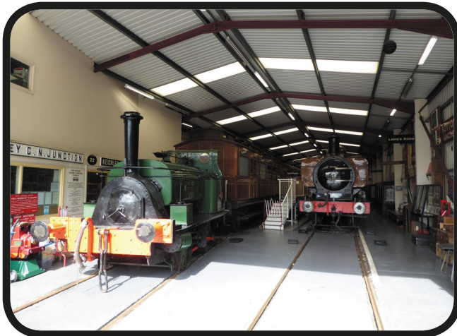
Everything back in place!