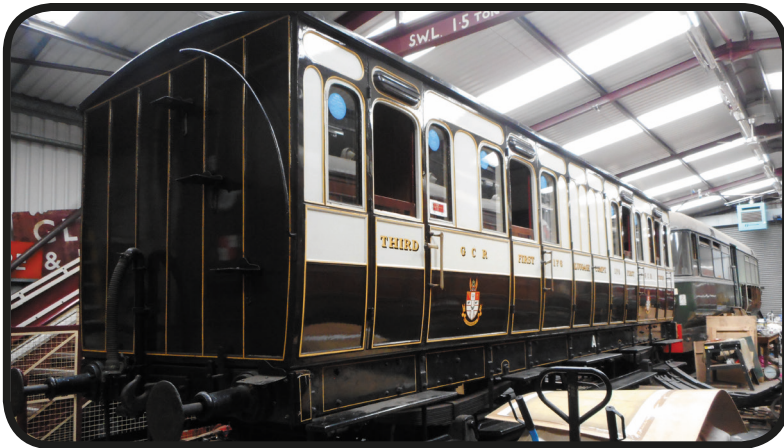
MS&L No 176 having a spruce up in the VCT workshop.

No 176 MS&L (GC) Four Wheeled Composite Carriage - Restored in Great Central livery and available for filming and museum display only.