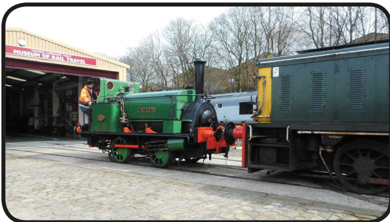
Lord Mayor outside VCT during the recent shunt.

W & M Diesel Railbus E79962 - Awaiting a full review with costings before any restoration begins.