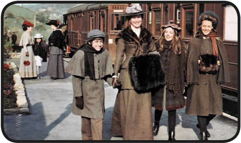
The 1970 'Railway Children'.

The Vintage Carriages Trust owns five of the carriages that were used in The Railway Children productions, which are now on display in the Carriage Works museum. The carriages used in the 1970 film were: Metropolitan Railway 427, Metropolitan Railway 509, Great Northern Railway 589, Midland Railway 358, and Metropolitan Railway 465. Three of these also starred in the lesser known 1968 TV series of the same name for BBCTV. Sometimes carriages don't have to play a starring role to be part of a film production. Our Southern Railway 'Chatham' No 3554 carriage was used as a dressing room on the set! Our locomotive Lord Mayor was also used in promotional photography for the film.