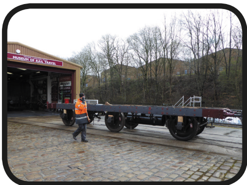
I) No358 Midland Underframe during the recent shunt.