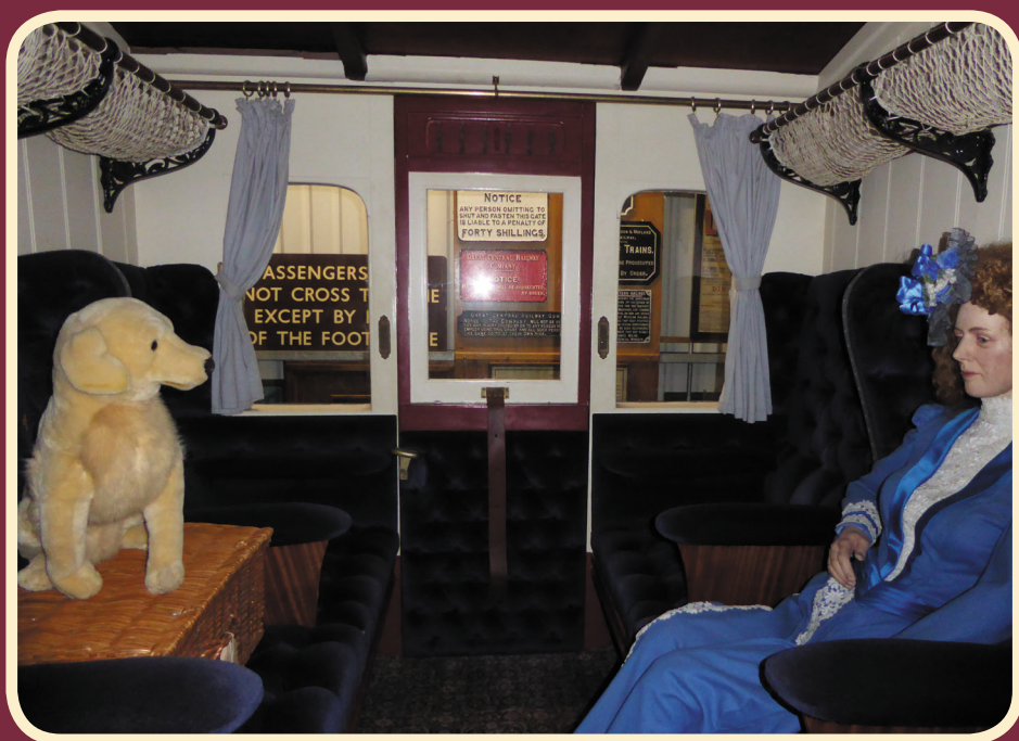
Occupants on display in our MS&L first class compartment.

Data Protection Act. VCT is registered under this Act. The Trust's Membership records are included within this registration. VCT Membership records are not made available to any outside bodies.