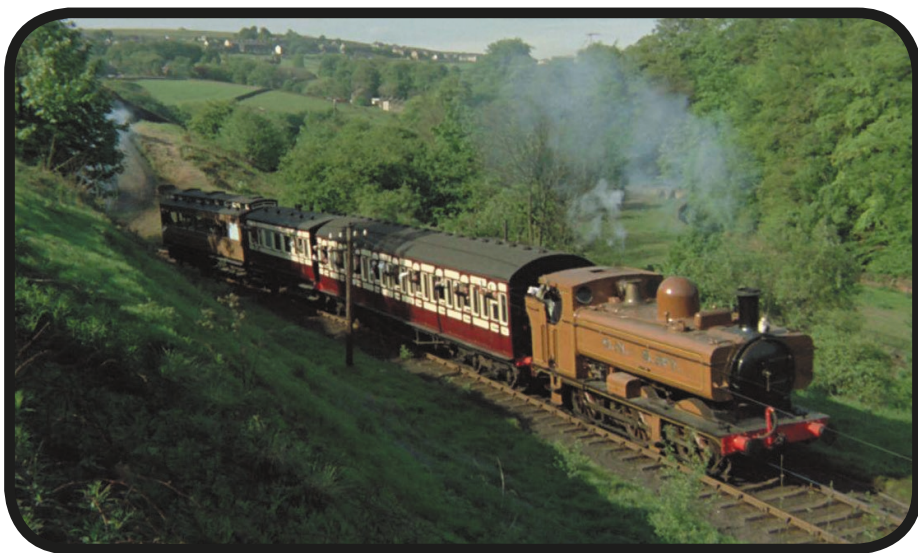
VCT carriages in 'The Railway Children' film.

Until the end of June, VCT will host a 'Railway Children' exhibition involving our carriages alongside the North Eastern 21661 'Old Gentleman's Saloon' and the GWR No 5775 Pannier Tank, which featured in the original film.