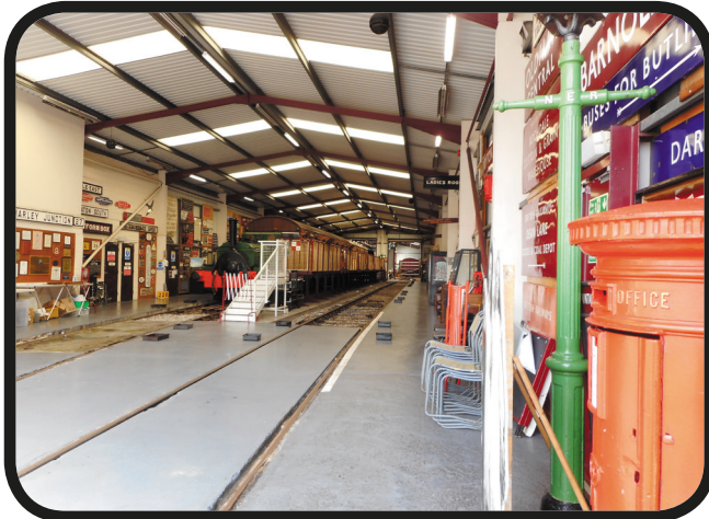
A half empty museum during the shunt.

After the Shunt: When completed and the diesel shunter has departed the reverse process is carried out of reconnecting AV leads, restoring access to carriages from the walkway and changing descriptive boards. At this point we are ready once again to allow access for visitors.