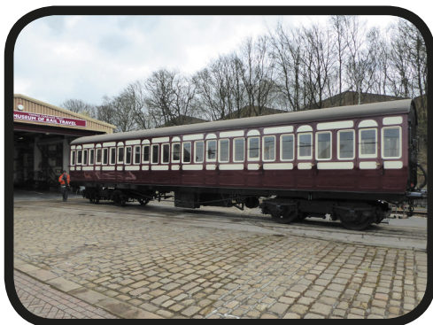
II) Metropolitan No 465 in its current 'Railway Children' livery.

Other Considerations: In the planning process careful thought is given to the carriages to be within the VCT museum allowing access to their compartments for our visitors from the central walkway. This includes maximising the number of doors we can open to the public and making the best use of the Audio Visual systems within the carriages. Obviously for safety reasons we keep the museum closed during the shunting process. Before the process begins we have to ensure that all doors of the carriages are closed, foot flaps lifted up, AV leads disconnected, floor rail protectors removed, and that there are no static obstacles in the way.