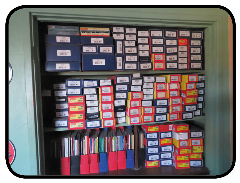
A small part of the model railway legacy stock in the house