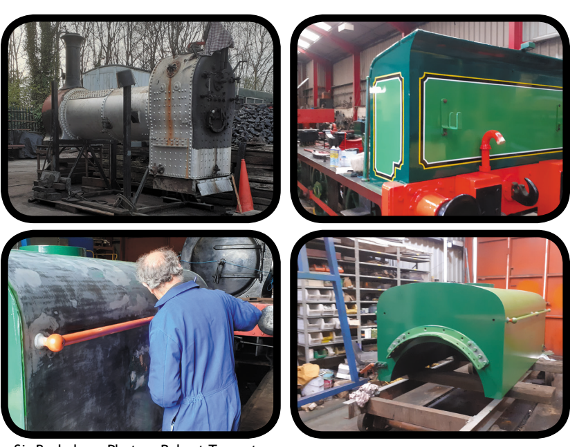
Sir Berkeley

Sir Berkeley - The overhaul of our 1890 Manning Wardle 0-6-0 Saddle Tank Sir Berkeley is progressing really well at its base on the Middleton Railway. The frames are now complete and are awaiting the boiler to be placed back on them. The reworked boiler is currently undergoing the usual and varied tests all of which are expected to be completed in the next few weeks. Painting into Logan and Hemingway contractor's livery has already started and we look forward to seeing the engine finished and in steam later this year.