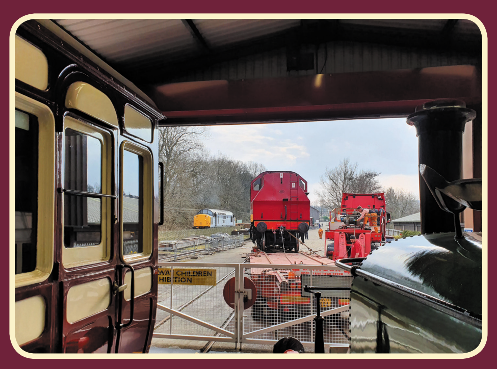
Unloading the KWVR Ivatt on its return from a North Norfolk Gala in April in front of VCT

Data Protection Act. VCT is registered under this Act. The Trust's Membership records are included within this registration. VCT Membership records are not made available to any outside bodies.