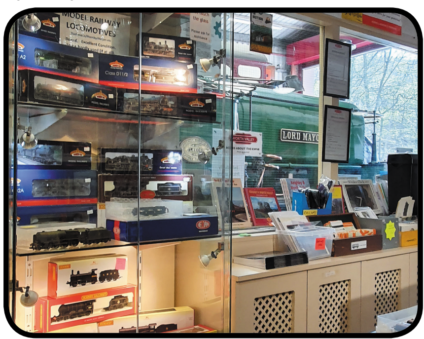
Model railway VCT shop display

Our late member has been very generous with his legacy, and illustrates how to leave everything to your favourite charities who have given you a lot of pleasure, particularly if you have no children or close relatives. It has been an interesting experience and his memorial is assured. The great news is that the model railway lines and railway books have been selling very well in the VCT shop at Ingrow earning funds equally for the KWVR Trust and the Vintage Carriages Trust.