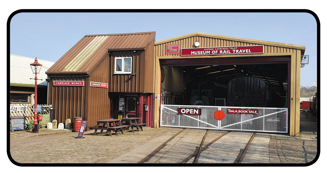
VCT Museum ready for visitors

Those members wishing to attend will need to inform us by 31st May, at the latest, so that we can be sure of the numbers attending. This can be done by email at membership@vintagecarriagestrust.org or by telephone to the museum between 11.00 am and 4.00 pm on 01535 680425. Please state your name and email address or telephone number as these will be required. This will allow us to send out final details and arrange the buffet.