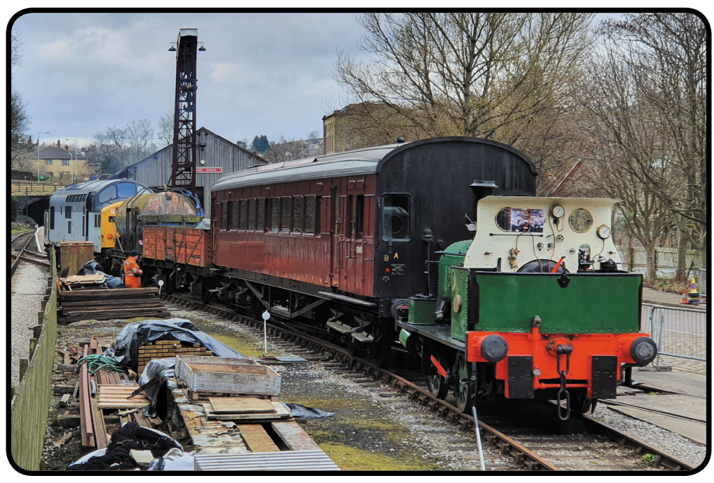
VCT Chatham carriage leaving our Museum for use at the KWVR March Steam Gala

This carriage has been used again during the recent KWVR spring steam gala and is planned to be used on KWVR Vintage Trains this summer.