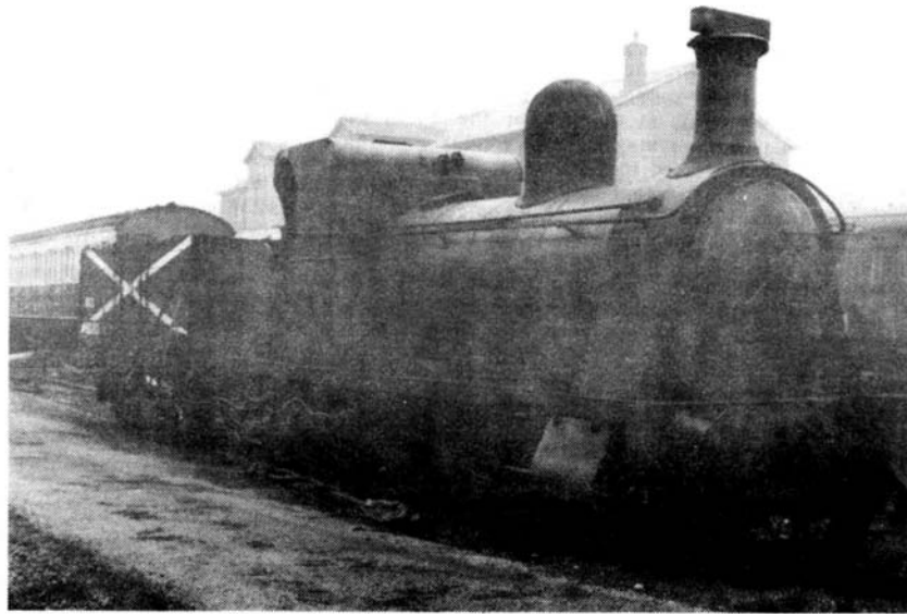
Before the start of restoration.....