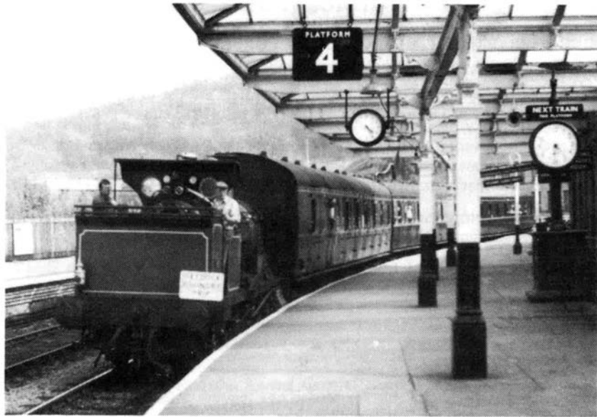
Bellerophon arriving at Keighley on 26th April 1987 with the Haydock Foundry Trip