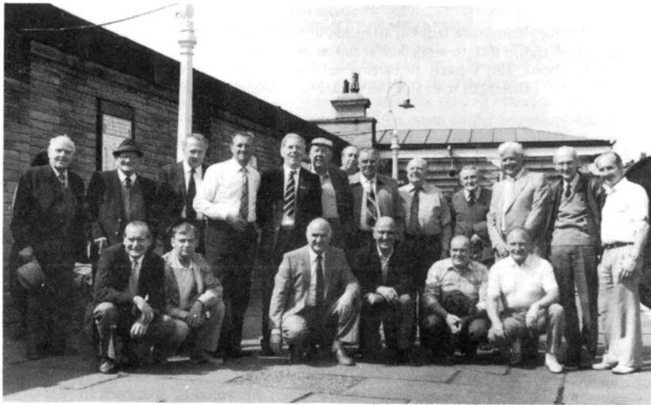
Ex-Haydock Foundry workers at Keighley Station. 26th April 1987.