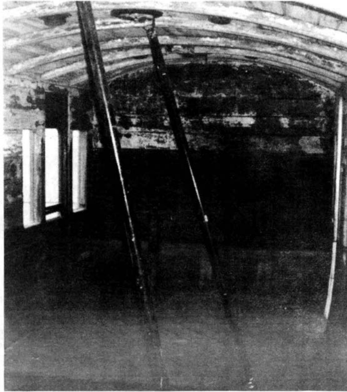
Interior of Midland 6-Wheeler at present. The partitions required to give strength to the body and roof would replace the supports.