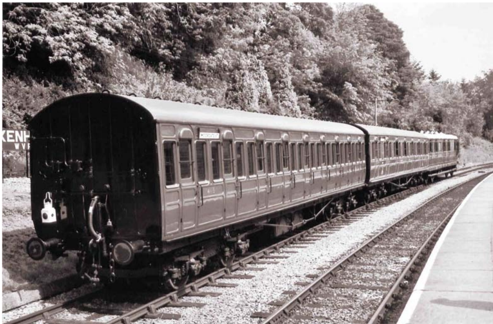
3 rd June 2007 and the Railway's first 'Vintage Train' day of the year – our two Mets. and GNR No. 2856 in the loop at Oxenhope, awaiting attachment of the North Eastern Saloon to complete the train.