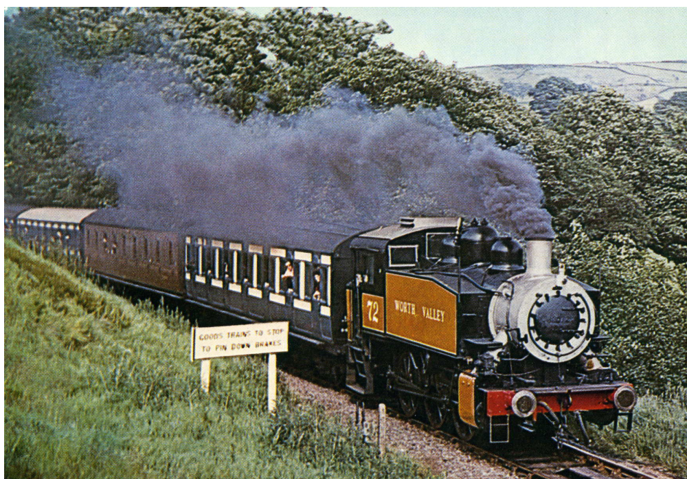
Not the Re-Opening Train – but the Railway's first colour postcard, WVI, showing locomotive 72 and two of the Metropolitan carriages in their "Re-Opening" liveries in the very early days of regular operation.

We will report further on these initiatives and about the Railway's own plans to celebrate this Anniversary in the Spring issue of this Newsletter . This will include details of the Railway's extra Gala Weekend to be held in June to mark this event. For the moment, this weekend is included in the list of events to take place during 2008. You will find this later in the present Newsletter .