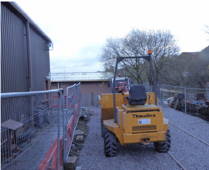
29 th November 2015: a miserable Winter's day – but with the Contractor's compound well in hand!

The Trustees and our Museum Mentor all agree that it is in the best interests of the Trust to continue with the project. We have sufficient funds to construct the foundations thanks to the many donations from members already, and we are appealing again for you to assist. However, if we are to continue with the building structure, cladding and fitting out within two years we believe that we need also to look for loans . If any members are in a position to consider interest free loans, we would be pleased to hear from you. Some have already approached us to offer their support in this way as we did for the Workshop back in the 1990s. Please contact me if you would, we would be.”