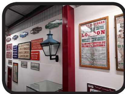
Stations Bay under construction