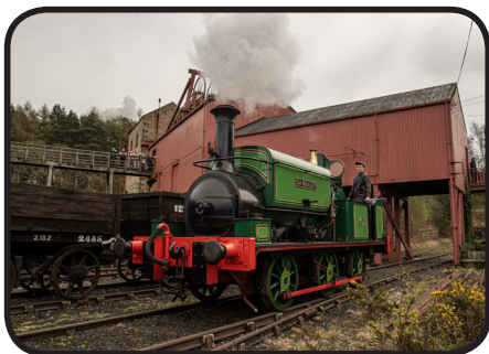
Sir Berkeley at Beamish April 2024

It is hoped that further steamings at Middleton will take place later this year once the cause of the failure has been identified and repaired.