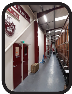
Completed Cladding Phase 2 Wall Bays

Bay 4 - Stations including signage, artefacts, and details of a typical historical station staff.