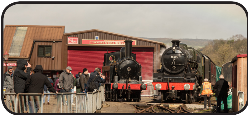
BLS Engines 45596 Bahamas and 1054 Coal Tank at the KWVR Steam Gala March 2024

The photograph below shows the two locomotives from our friends at BLS in front of our Museum during the Gala.