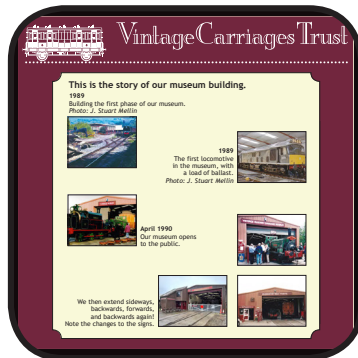
VCT Bay Planned Interpretation Boards