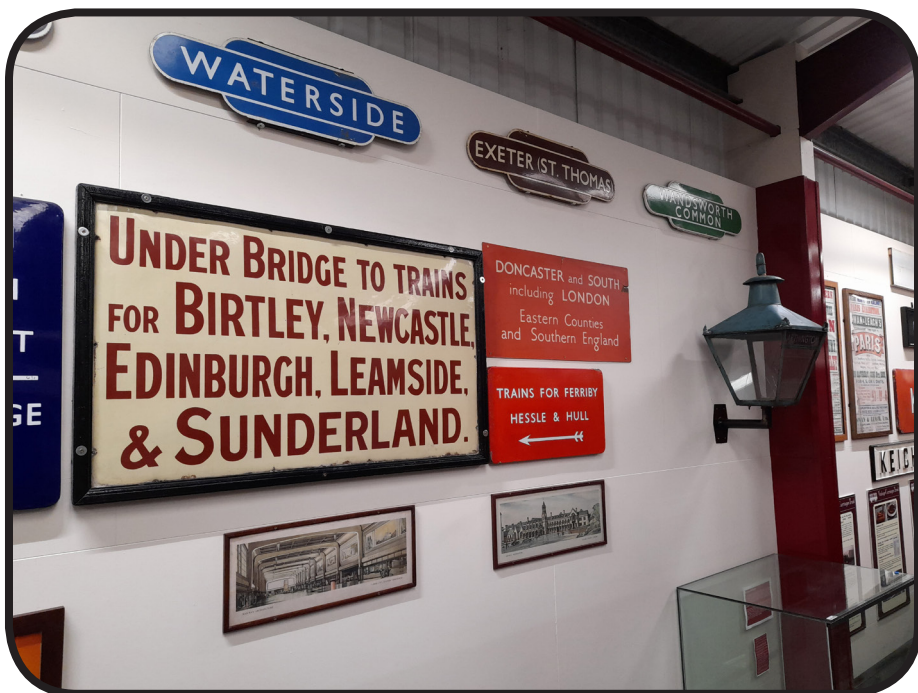
Station bay under construction

Paul Holroyd, using the same successful style that he created for the three wall bays last year, is continuing to produce interesting and eye catching interpretation boards to explain the themes, signage and artefacts on these displays. The photographs in this issue give an indication of the results that have been achieved to date, and it is hoped that all four of the wall displays will be completed this summer.