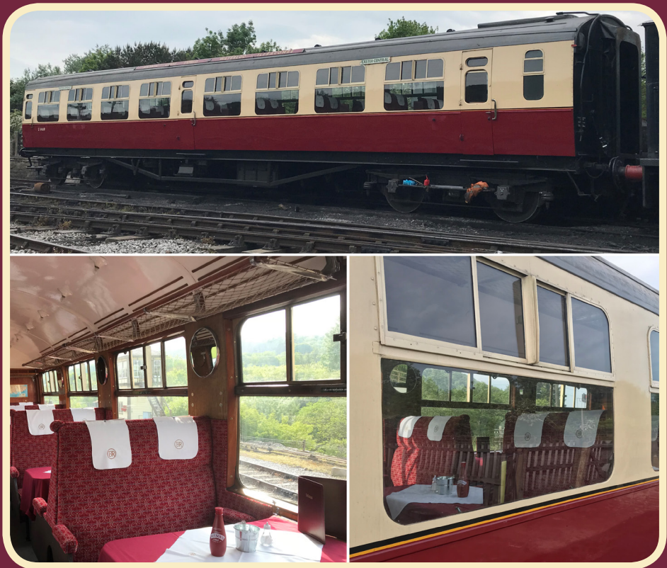
VCT S1469 Bulleid Carriage still in use at Emsay

Data Protection Act. VCT is registered under this Act. The Trust's Membership records are included within this registration. VCT Membership records are not made available to any outside bodies.