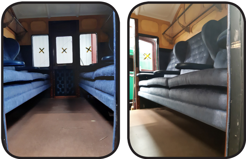
Midland 1st Class Interiors