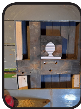
Rebuilding the Chatham brake