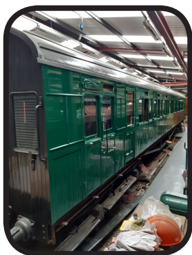
Chatham in final green livery

The plan is to have this carriage looking well, and even better than previously planned, in time for the Chairman's Day in June. We are hopeful as well that we will have the carriage out on the KWVR to celebrate its centenary at some point later this year.