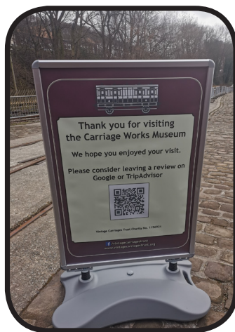
New Museum Welcome and Thank You Sign