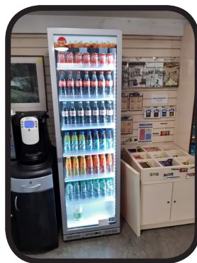
New Coca Cola Cooler