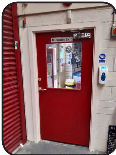
New Wider Exit Door to Shop - Photo: Bob Sprot