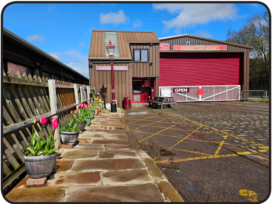
VCT Museum and Flower Boxes March 2024

Those members wishing to attend will need to inform us by 31st May , at the latest, so that we can plan for the numbers attending. This can be by email to membership@vintagecarriagetrust.org or by telephone to the Museum between 11.00 am and 4.00 pm on 01535 680425 . Please state your name and email address or telephone number, as these will be required. This will allow us to send out final details and arrange the buffet.