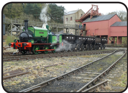
Sir Berkeley with Chaldron Wagons at Beamish April 2024